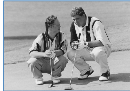
Special Olympics Nebraska Golfers.

Proceeds from this tournament will be used to support Special Olympics statewide. Special Olympics Nebraska is funded exclusively by contributions from individuals, businesses, organizations and private foundations.